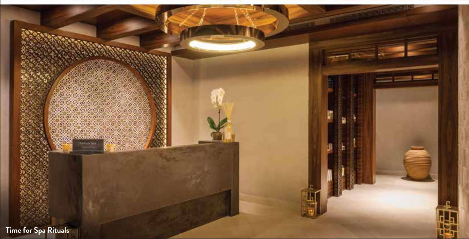
Time for Spa Rituals