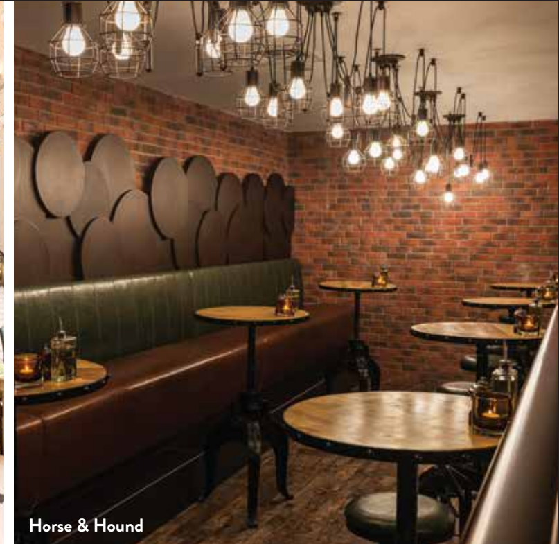
Horse & Hound