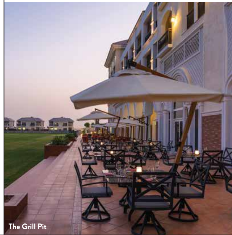
The Grill Pit